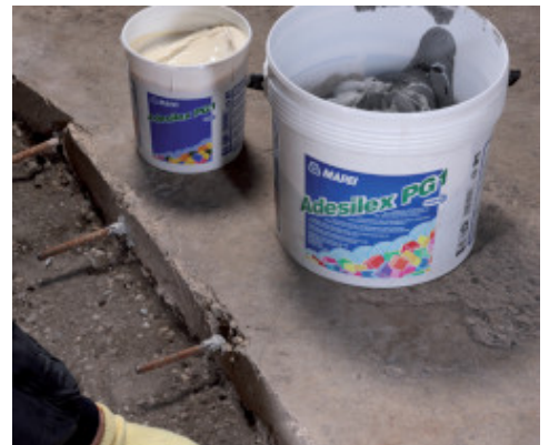
Fixing reinforcement rods for the dowelling in place using Adesilex PG1