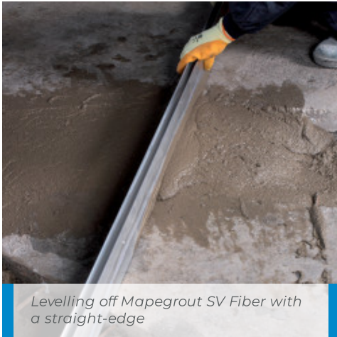
Levelling off Mapegrout SV Fiber with a straight-edge