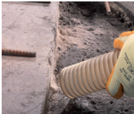
Removing dust with a vacuum cleaner