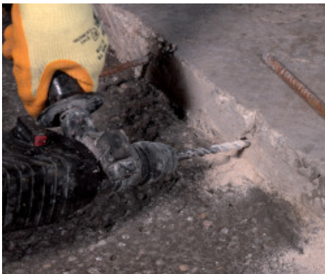
Preparation of the holes to insert the reinforcement rods (dowelling)

If applied in formwork, water must not be absorbed from Mapegrout SV Fiber . In this case, we recommend treating the formwork with a form-release agent (for example Form Release Agent DMA 1000 ).