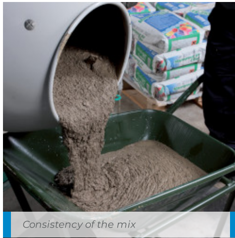
Consistency of the mix