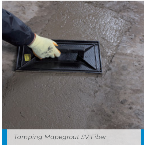
Tamping Mapegrout SV Fiber