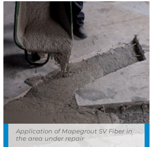
Application of Mapegrout SV Fiber in the area under repair