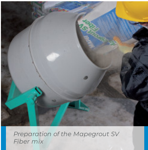
Preparation of the Mapegrout SV Fiber mix